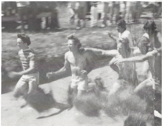
... When Some A.J.A. Students Participated In The Mud Rally?