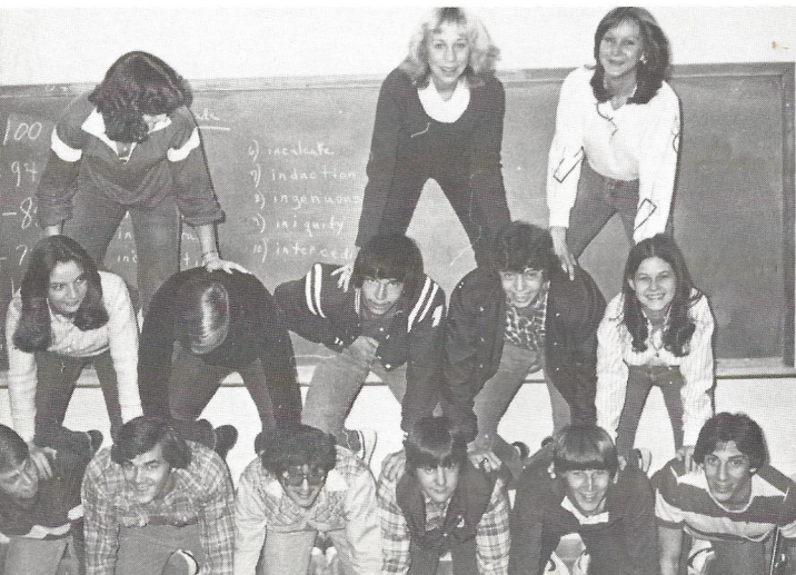
... The Day The Seniors Built A Pyramid?