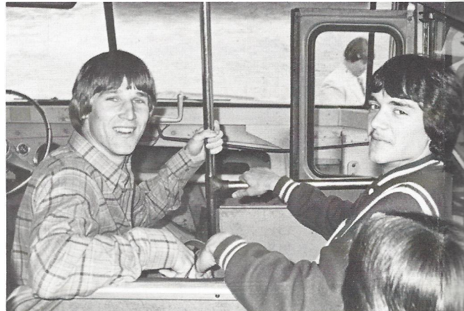
... Riding "Big Red" To The Ballgames?