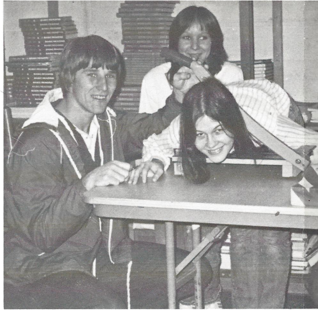
... All Those Times When we Thought We Just Couldn't Go On?

How delighted I was to receive your get well message! It tells me of your friendship and makes me happy. I know with so many young people rooting for me that it won't be long before I'm feeling better.