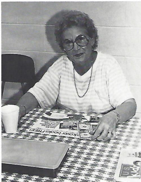
I'm into money!