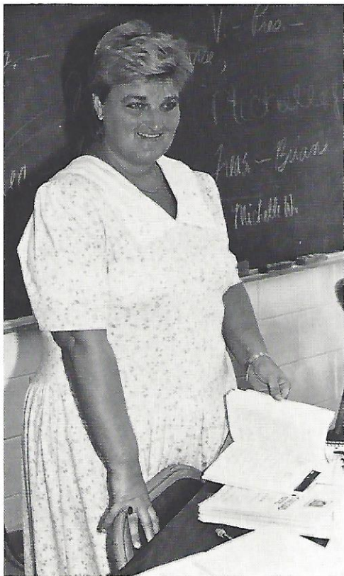
"I'll make a believer out of you!"