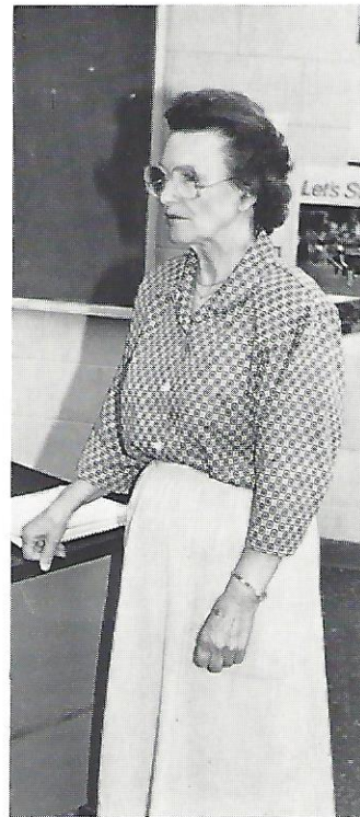
"I saw you!"