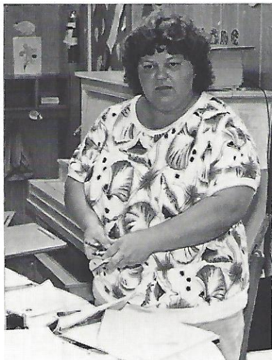
"I don't care!"