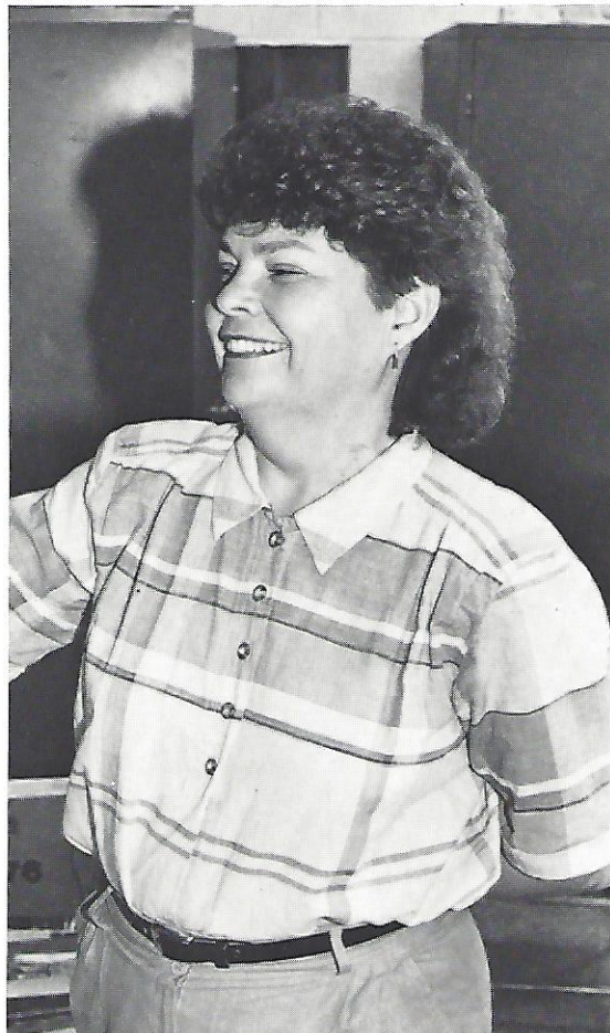
"Ha! Ha! Ha! So you don't understand!"