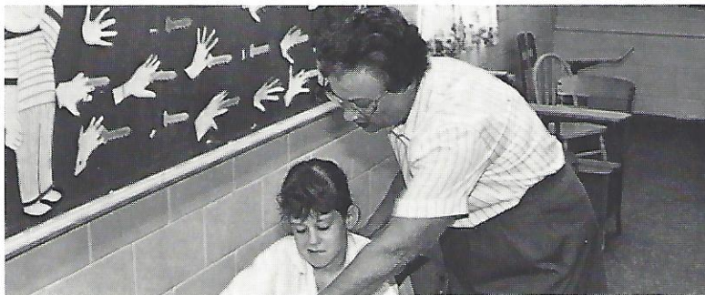
"Why me Lord?"