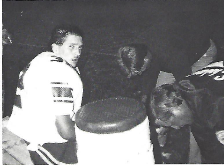
What do you want?