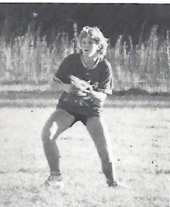
I think I can, I think I can