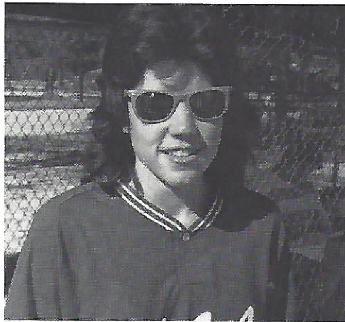
Makes you wonder ... don't it?