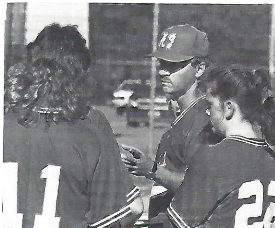
Never let them see you sweat