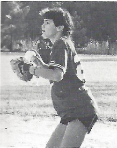
Here it comes!