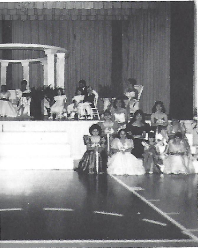
The May Pole Dancers were the May Day Attendants from grades 7-12.