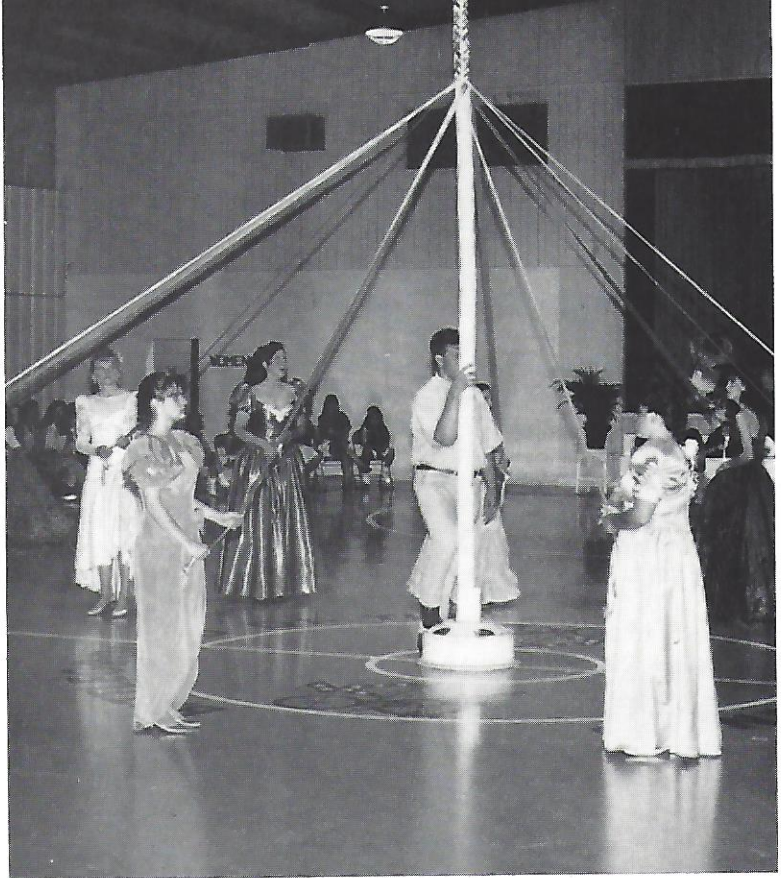
The 1993 May Court.