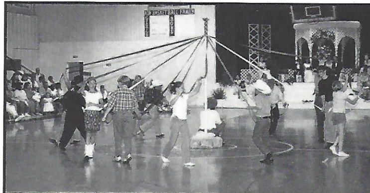
It just wouldn't be May Day without the fifth grade and the May Pole.