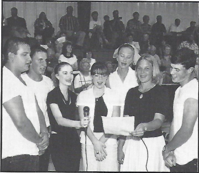
Now this group is definitely ready for the big time. I think a record deal is already in the making!