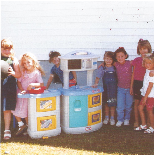
This energetic group enjoys a wide variety of activities from kickball to cooking.