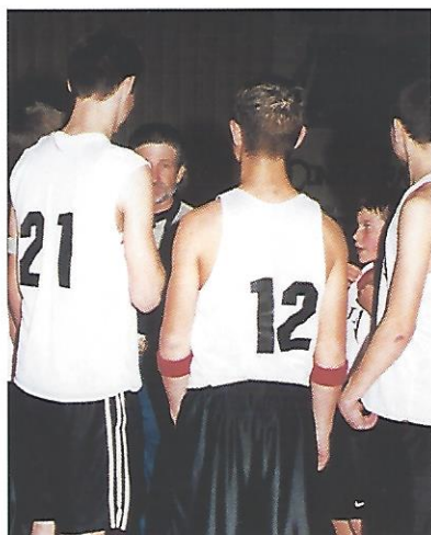
Team huddle time for Coach's instructions.