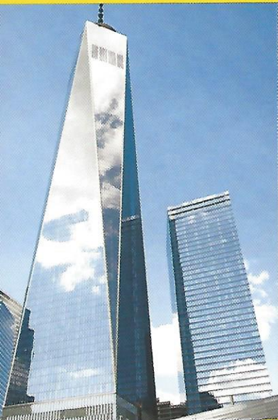
WORLD TRADE CENTER 2