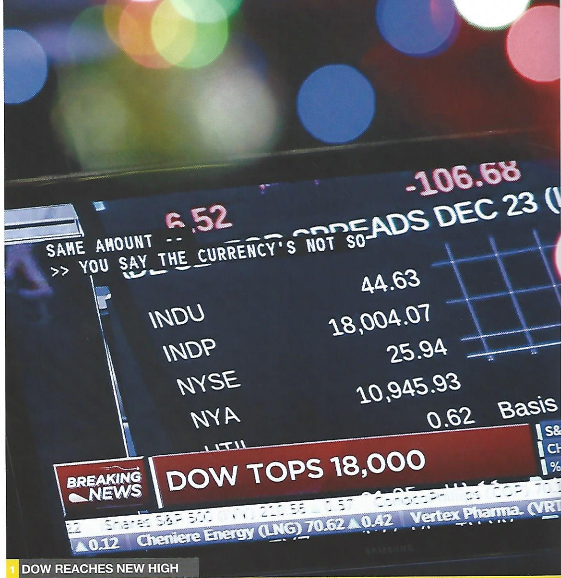
1 DOW REACHES NEW HIGH