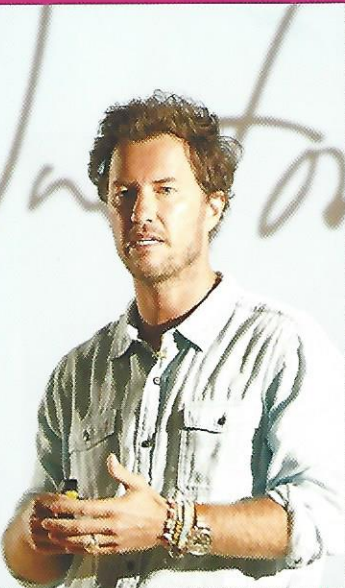
TOMS AT TARGET 2