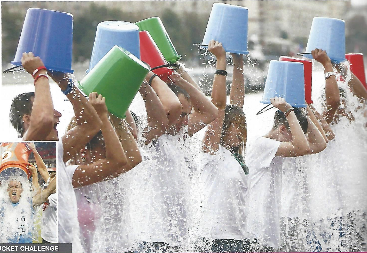
1 ICE BUCKET CHALLENGE