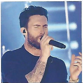
1 MAROON 5