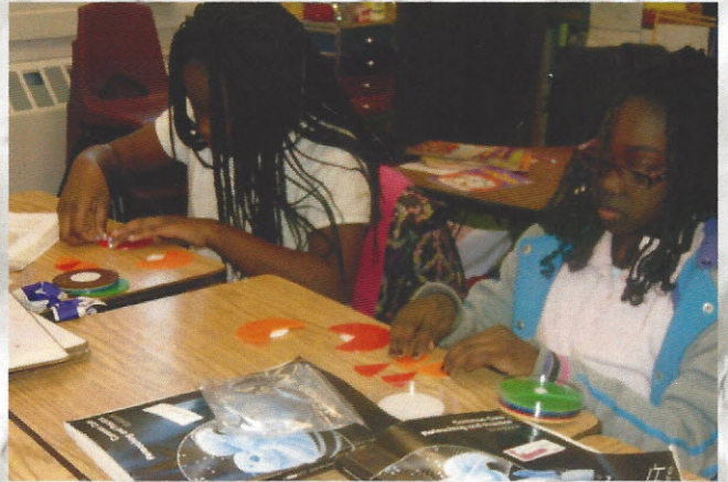
These learners are blossoming through third grade.