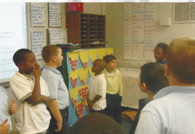
Third graders are growing in knowledge and in character.