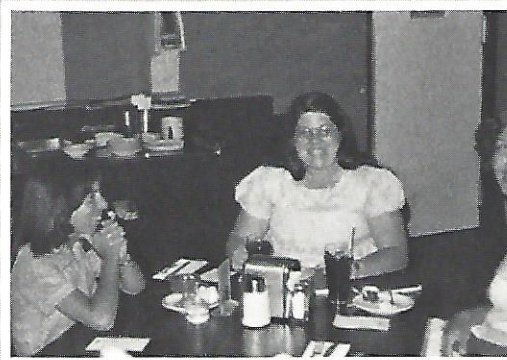
Did you say "cheese"?