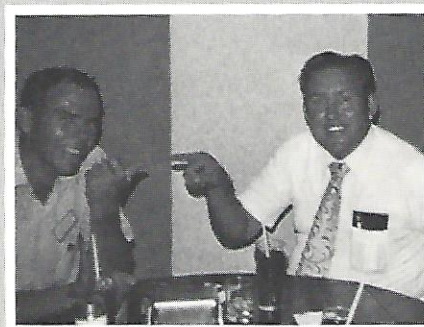
Who's paying the check?