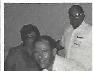
Bald is beautiful!