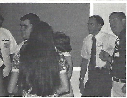
Now, this is the way it is . . .