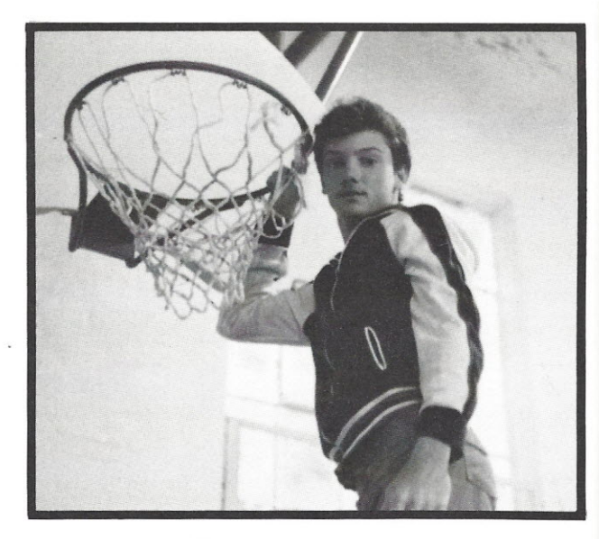
"A fantasy come true."