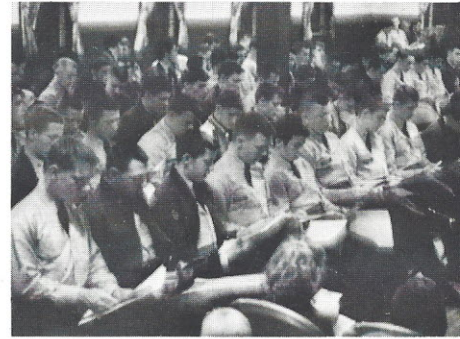
“We get to sing Christmas Carols.”