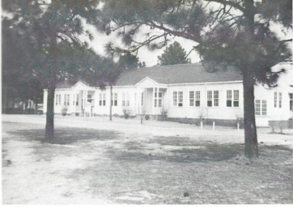
“Classroom building after school.”