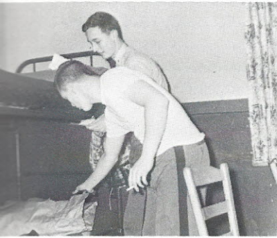
“Put up your laundry.”