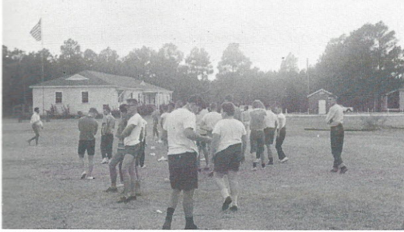
“Everybody can take part in intramurals.”