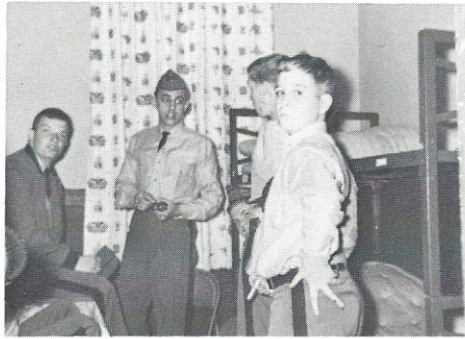
“You can strike up a conversation in any room.”