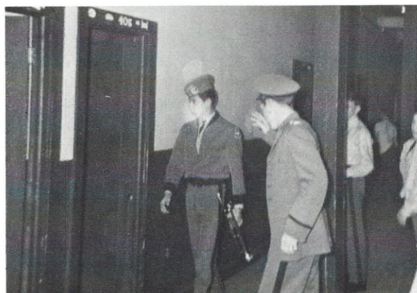
"Don't blow the Bugle, yet."