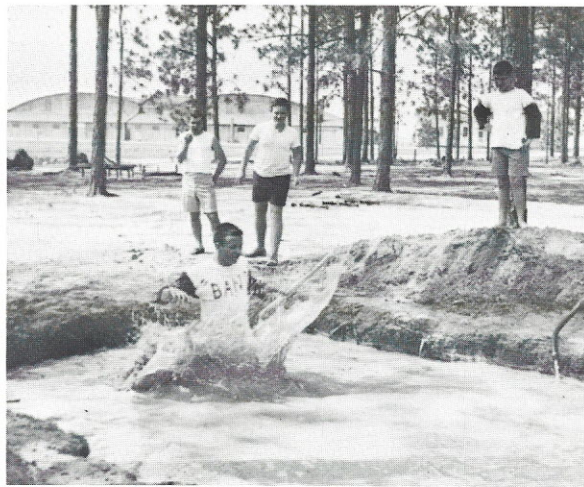
“Dane runs into an obstacle.”