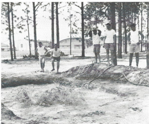
“Anyone for a dip.”