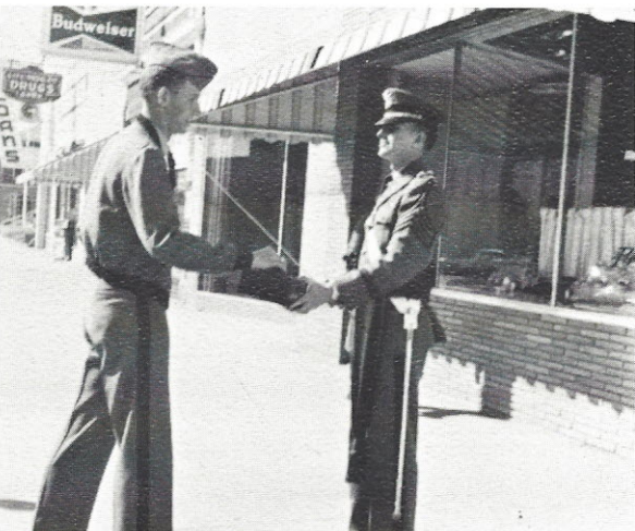
"Contribute or die."