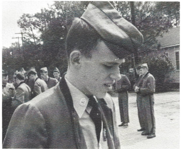
"Well, I finally got a letter."