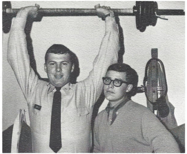
"I don't care if you are the O.D."