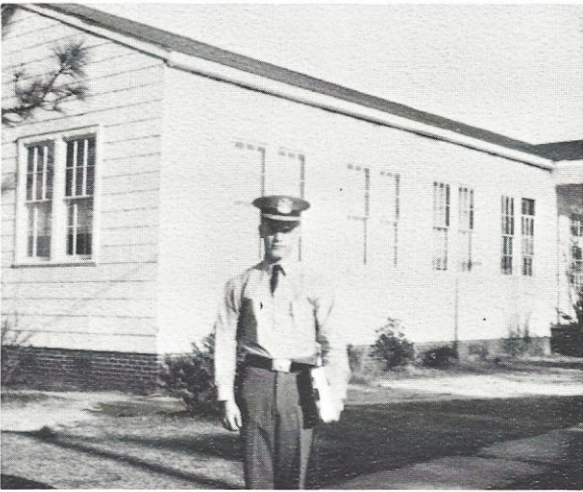
"I really love this military life."