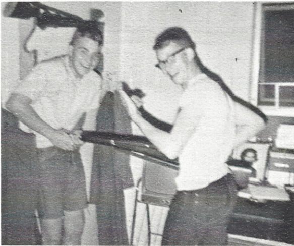
"I have my roomie trained."