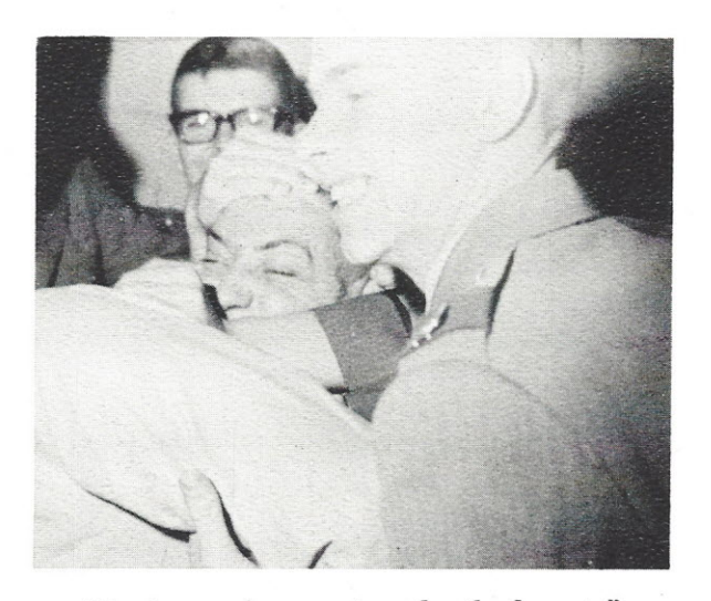
"Freshman show senior who the boss is."