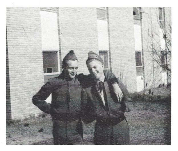
"Freshmen stick together."