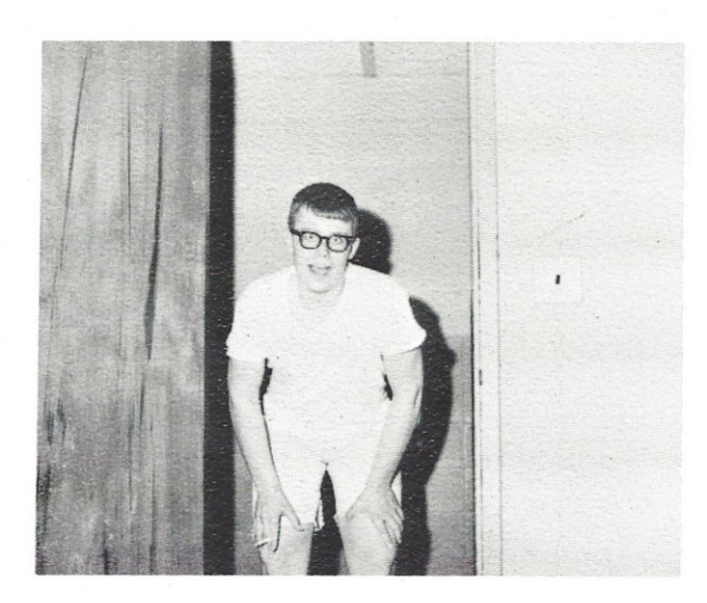
"We have apes too."