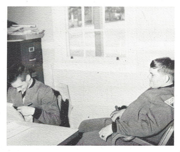
"Seniors show freshman what to do."