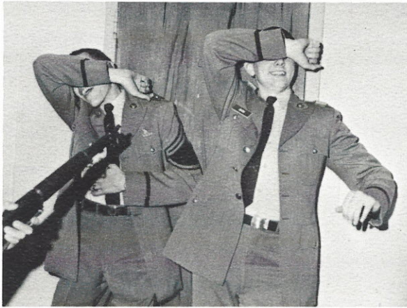
"No! No! It wasn't me!"