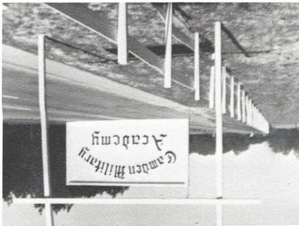
"Find any more mistakes?"