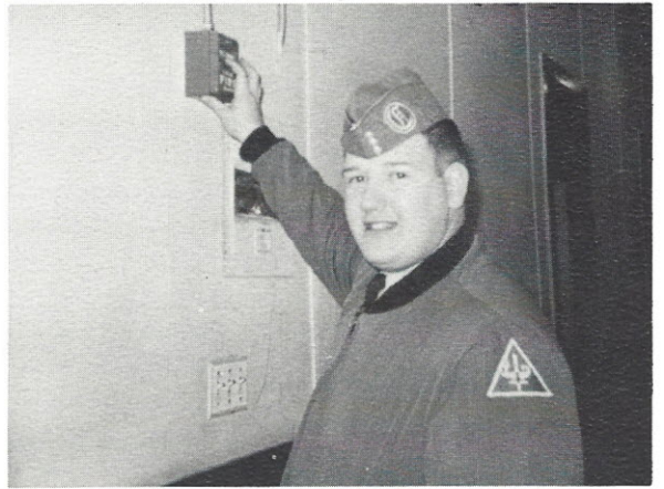
"I said move!"