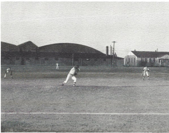
"They all try to get the ball."