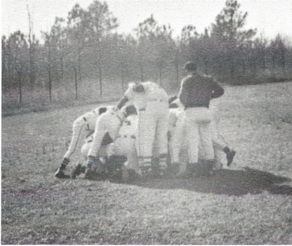
"Players have prayer before game."