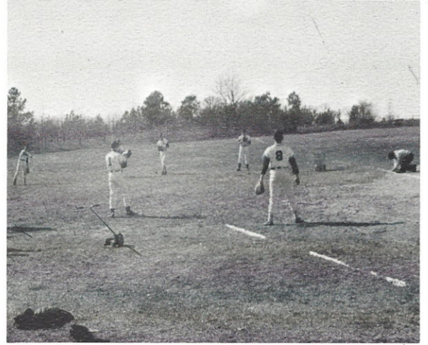
"Team practices before game."