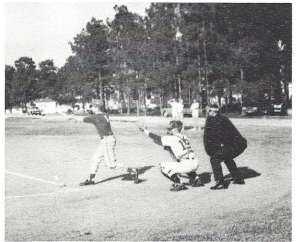
"Batter awaits the arrival of the ball."