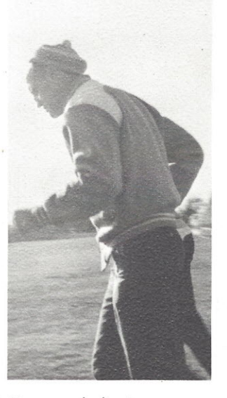
To you, our noble mentor of athletics, we dedicate THE 1968 EXCALIBUR