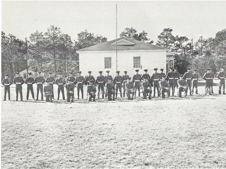
Privates First Class and Corporal.

The rank of non-commissioned officer is merely a stepping stone to greater responsibilities. They are the backbone of the battalion. These people are the ones through which the greater bulk of the military operations are carried out.