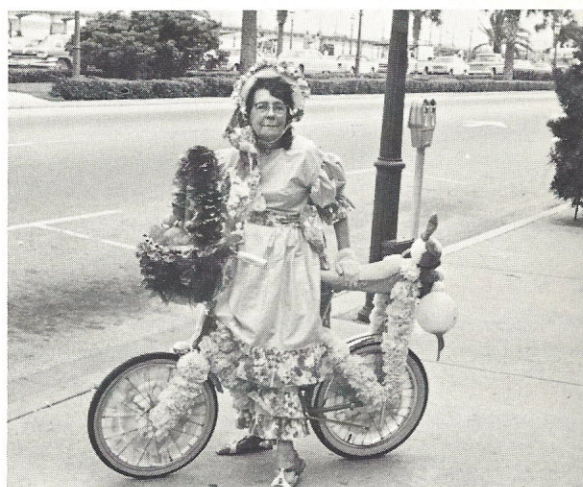
"Please, may my son have special leave?"