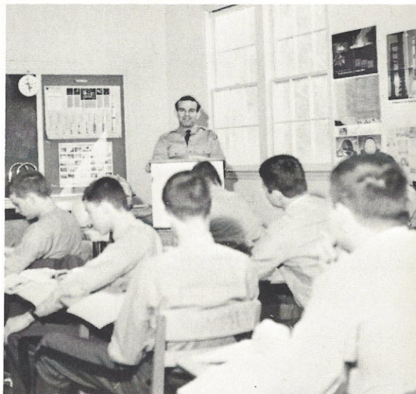
"My friends, today I will speak on the Joys of Geology."