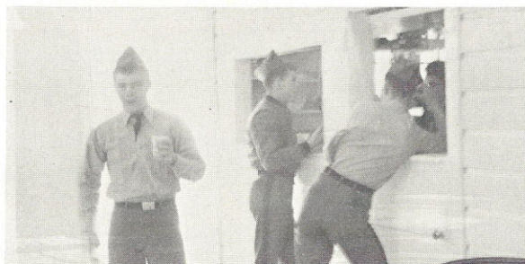
"I finally got a Falstaff!"