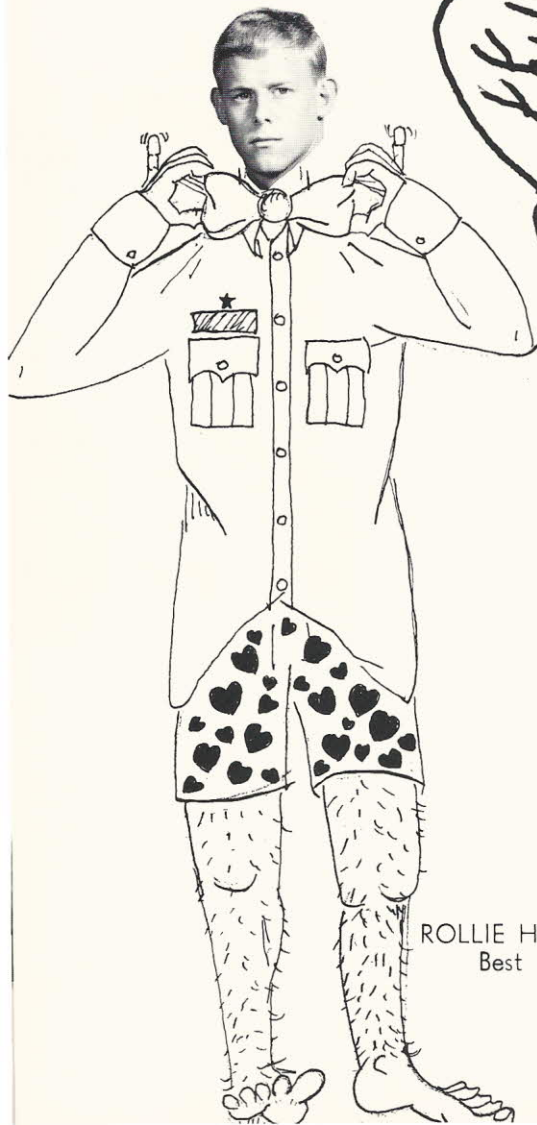
ROLLIE HUFFSTETLER Best Looking