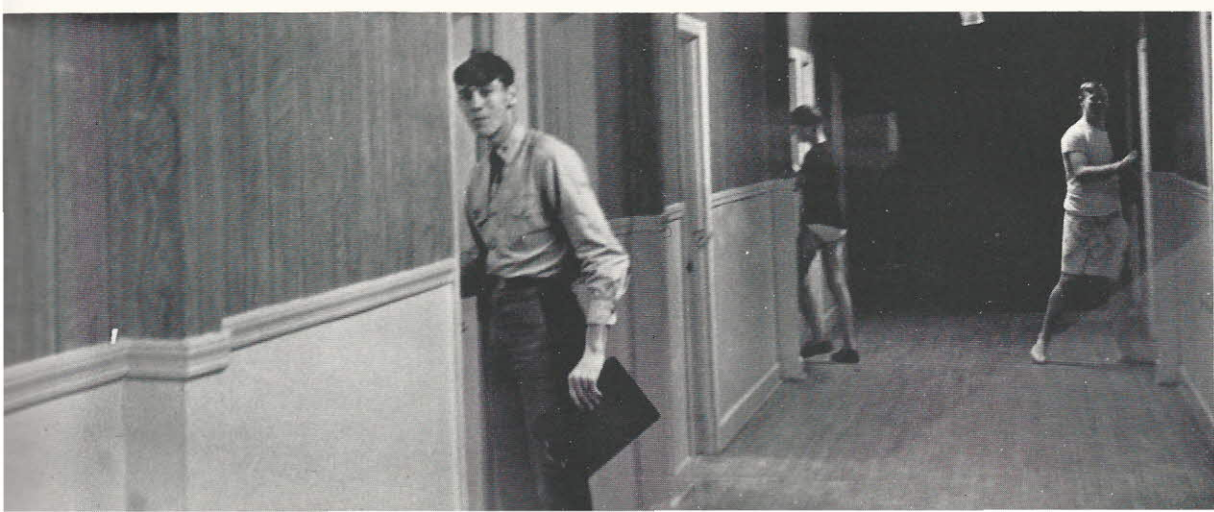
— — — But sir!??