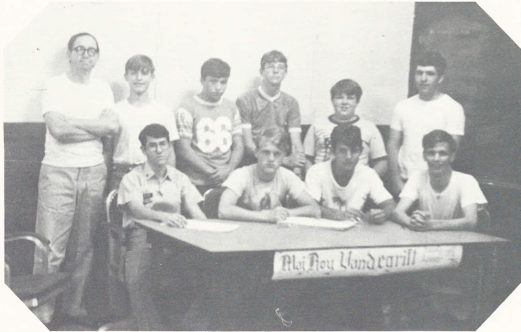
The Excalibur Staff