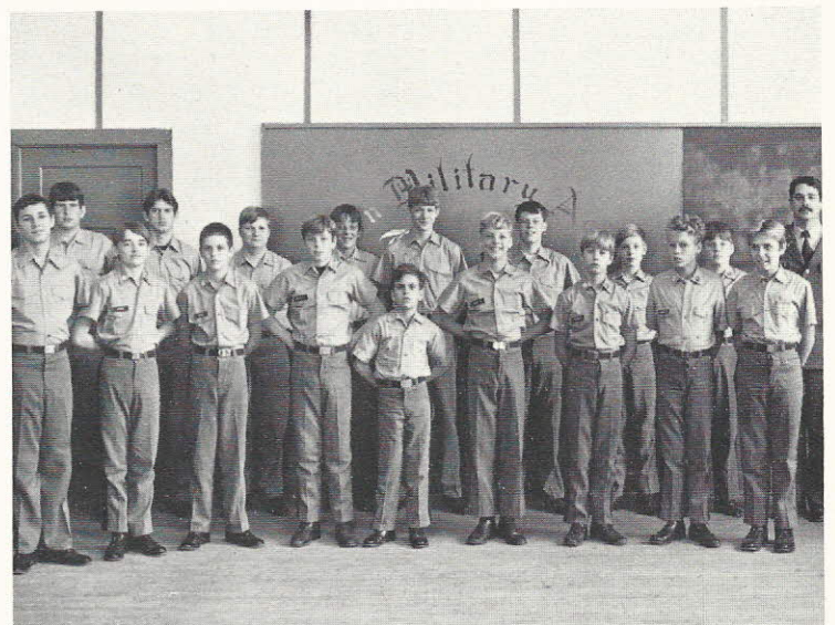
The Intermediate Band