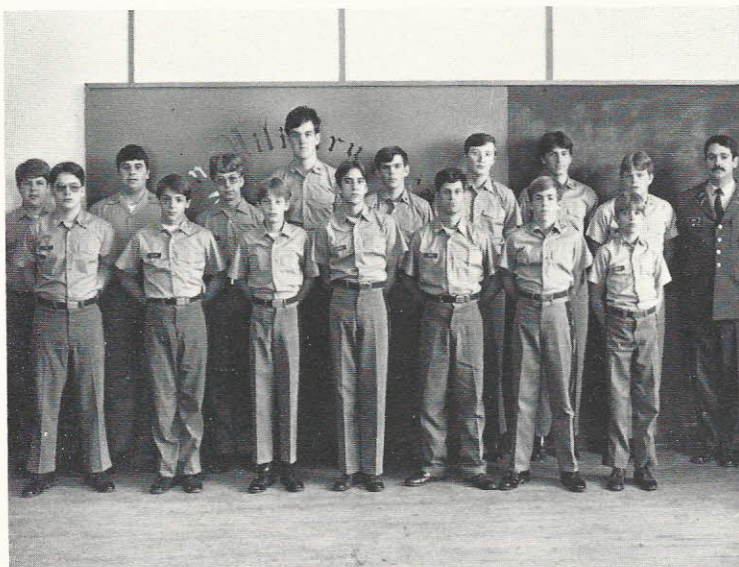
The Jazz Band