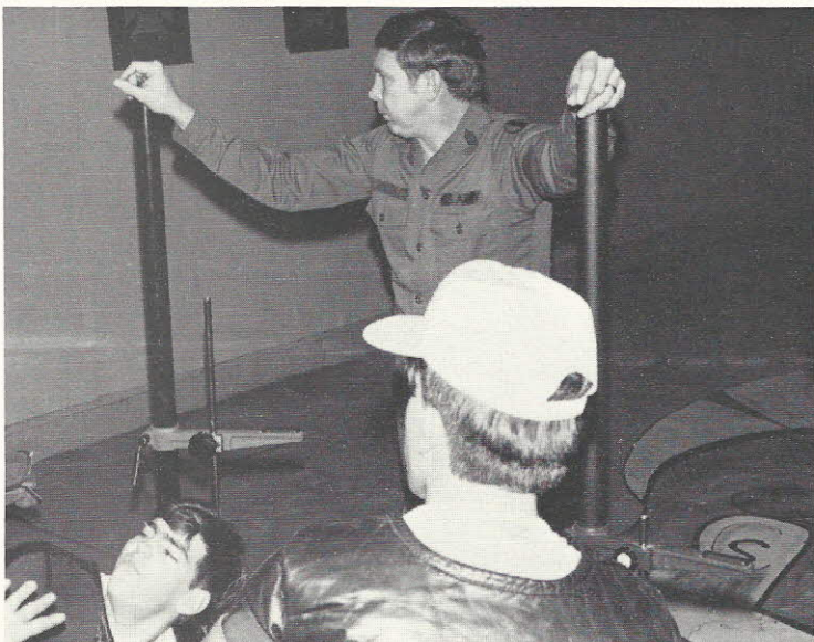
A break during the practice session.

Success for small bore rifle shooters requires physical and mental control coupled with team spirit and one hundred per cent effort on the firing line. The Rifle Team fires in many different types of matches on ranges varying from fifty feet to one hundred yards, and in one to four different firing positions. The team practices in our own five point, fifty foot range. Under the guidance of SFC Cayton and SFC Darrow, they achieved these recent records: