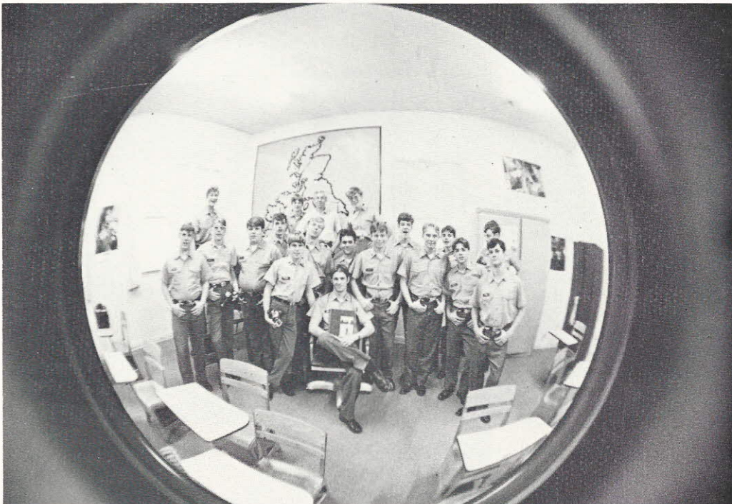
Adviser's eye view — it's fishy.