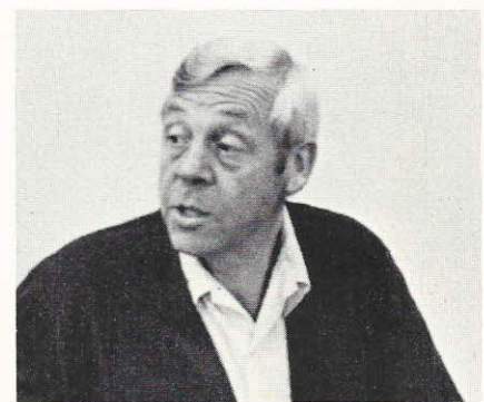
Oh, by the way, tomorrow's the deadline.