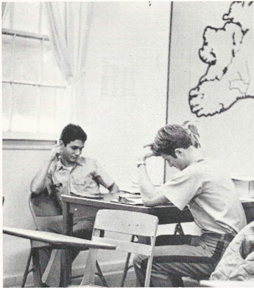
Hard at it.