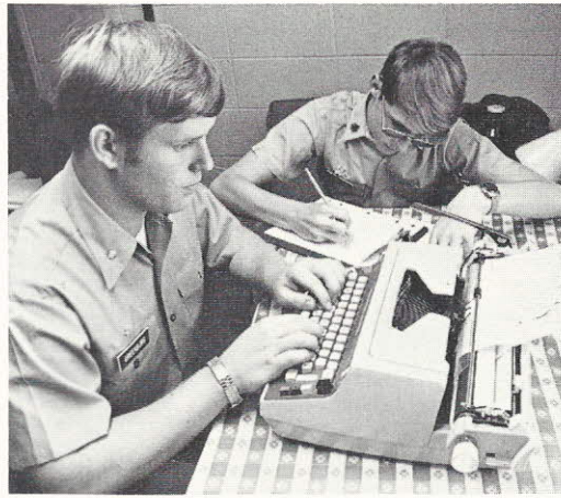
Even harder at it.