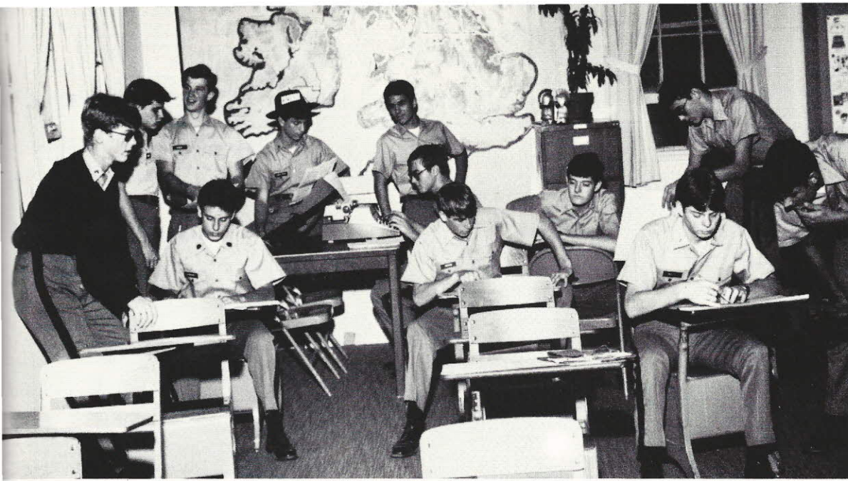
The entire staff works for a better publication.

The same group compiles the Excalibur , CMA's yearbook. The results of that effort are these very pages.