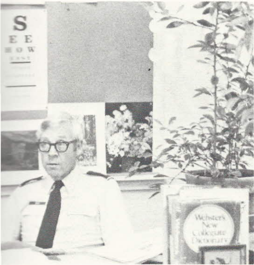
in Adjutant activity.