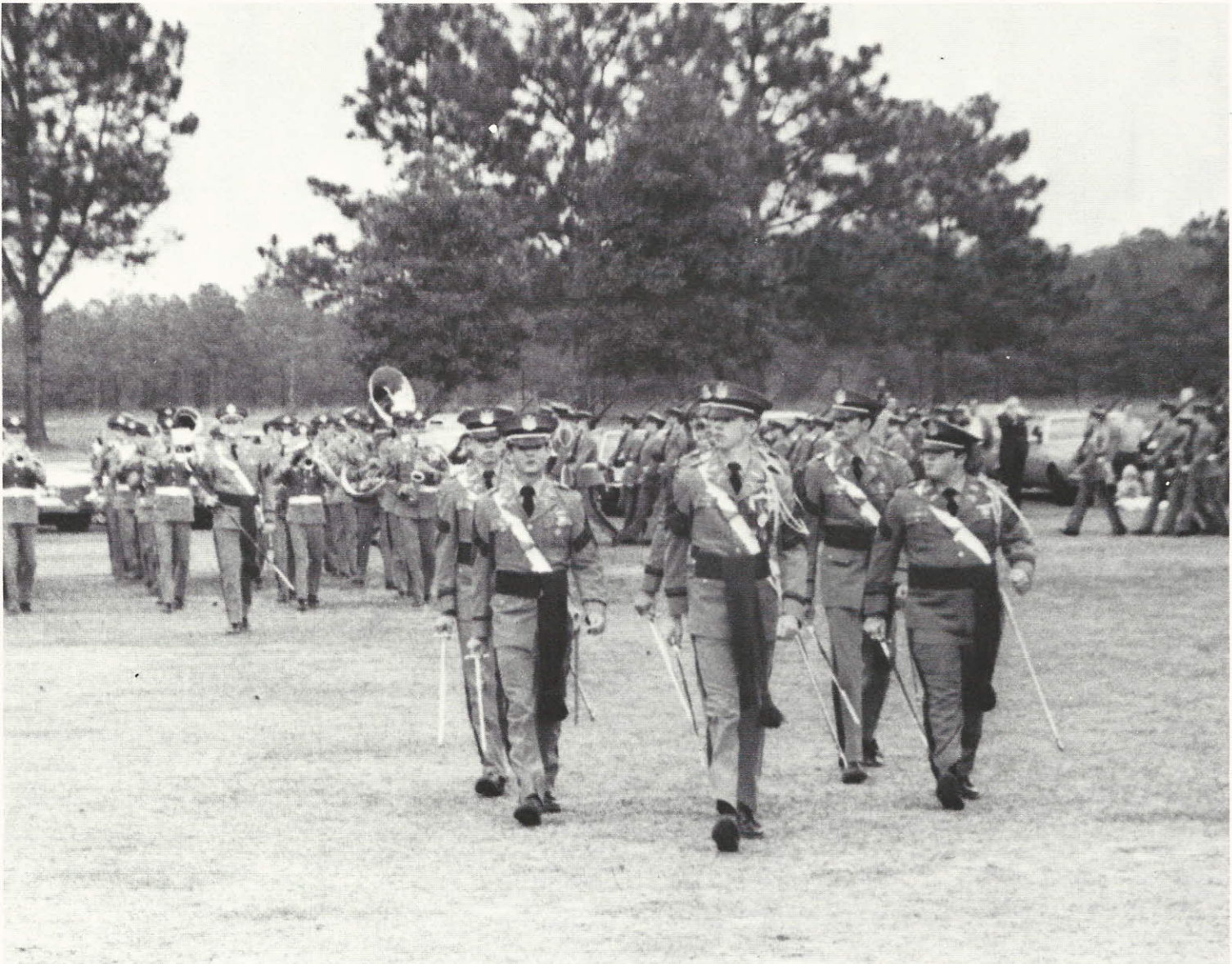
The battalion commander and his staff lead the corps in pass-in-review on fall visitors day.