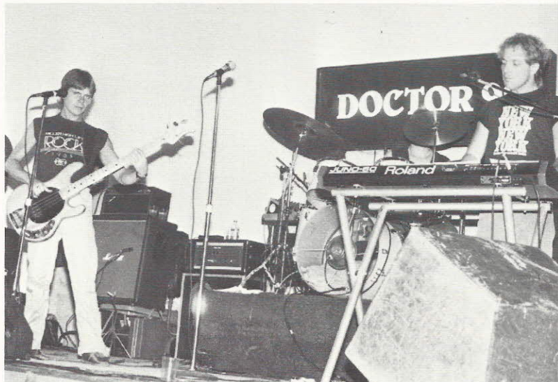
Doctor 99 supply musical medication.