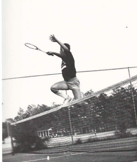
Match victor, just before skinning his nose on