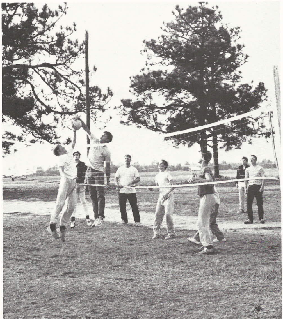
A "B" Company player attempts to slam the volleyball on "C's" side during intramural competition.

Besides organized programs, cadets may ride at the Camden Hunt Stables, play tennis on CMA's own courts, or cool off at the pool with its adjoining Carlisle House terrace, haven for applauding girlfriends.