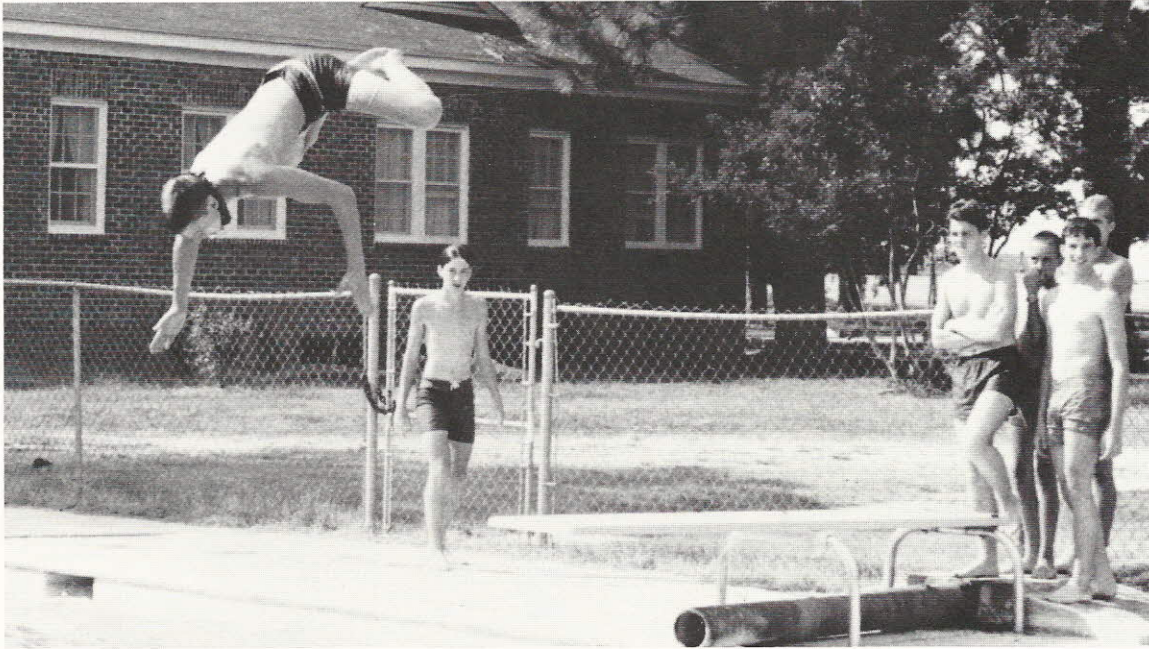
. . . cool out,