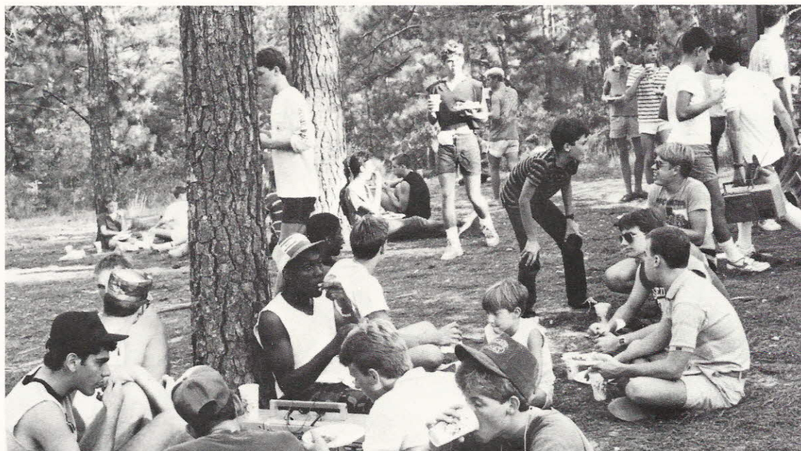
. . . dine alfresco at a Goodale State Park cook-out.