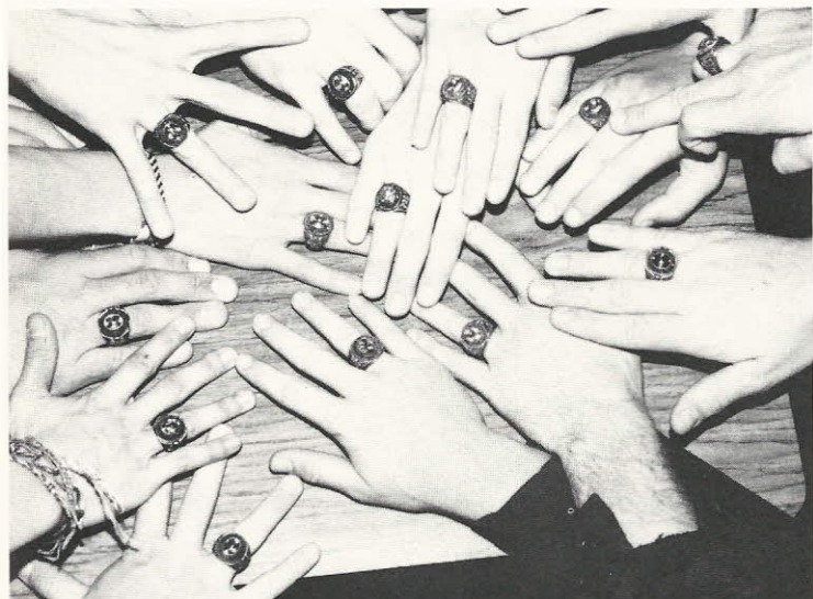
Fellowship of the ring.

*Post-Graduates **Summer School Graduates