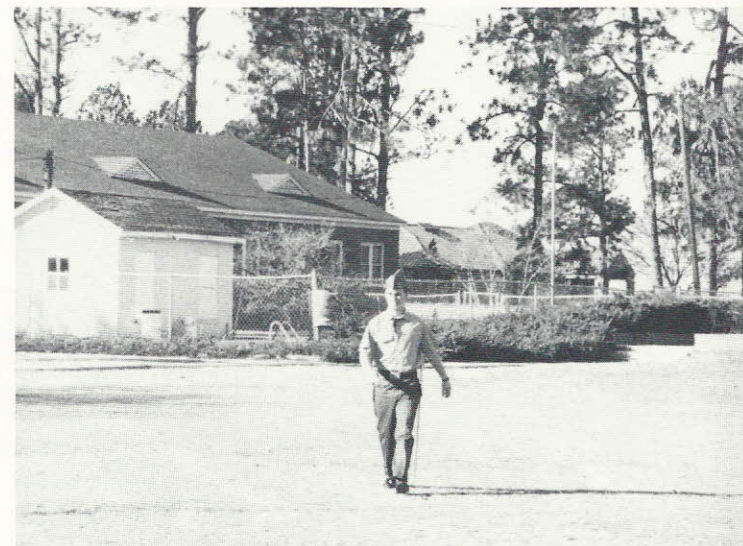
Hurry up, BJ — you're late!