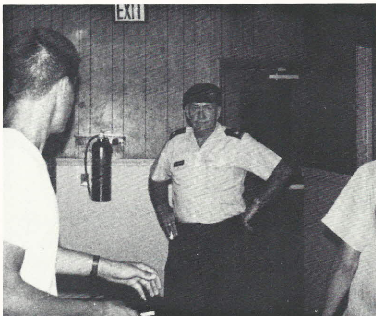
"All right, guys, what's going on here?"