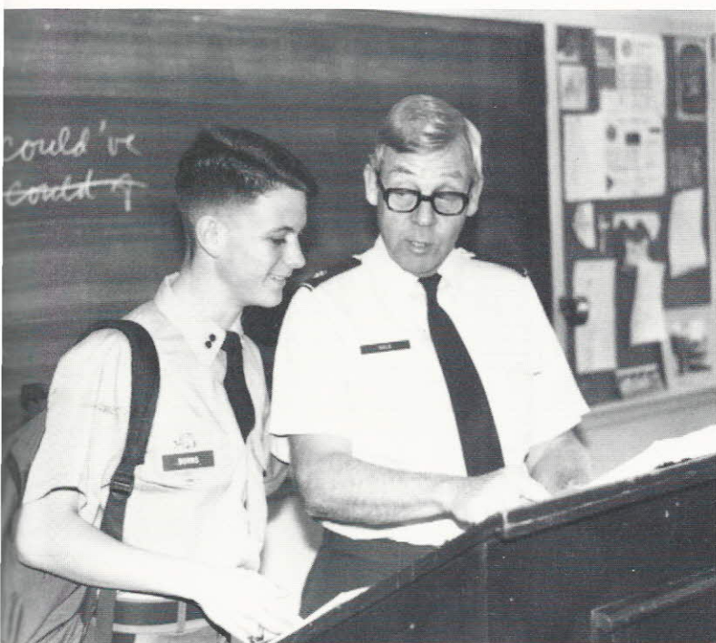
Is Major Gale making a subtle literary point, or is Burns just deciphering the "could of" for "could've" error?