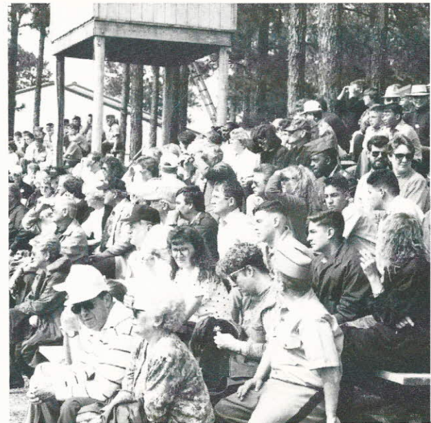
The CMA football team delighted spectators with outstanding play against Porter-Goud.