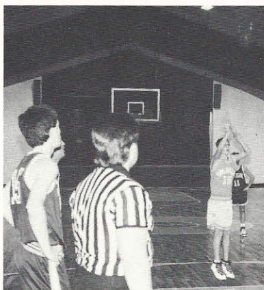
Mills floats a free throw toward the basket.