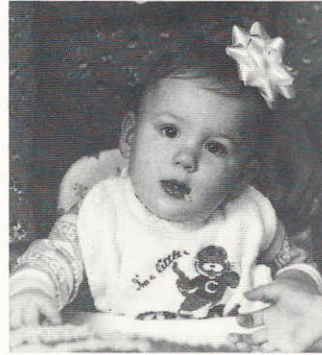
It was just the beginning.