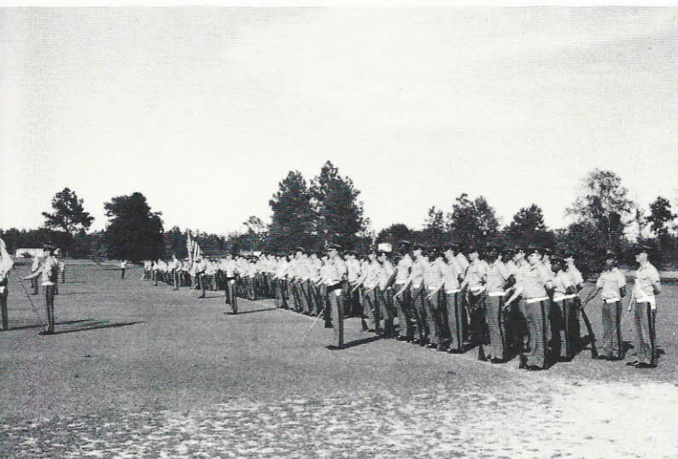
At parade rest on a warm October day: the Camden Military Academy Battalion.