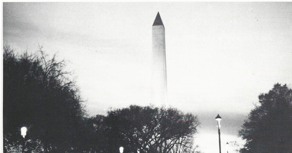
The Washington Monument at dusk