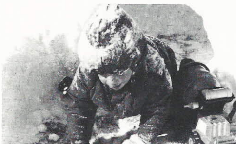
... climbed out of some tough situations