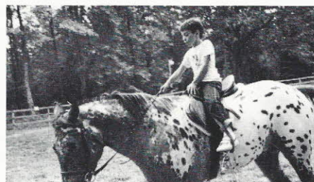
... traveled the hard road