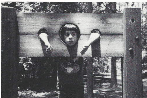
... took your punishments like a man