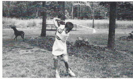
... gave it your best shot