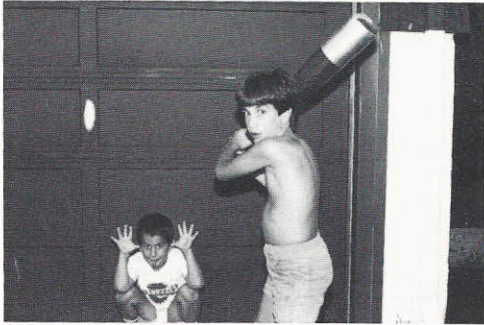
... hit a few home runs