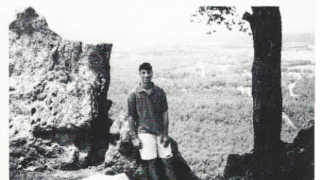
... climbed to the top of the peak only to see higher ones ahead