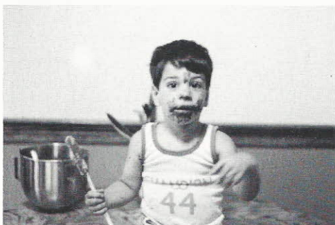
... whipped up a few surprises (or made a mess of things?)