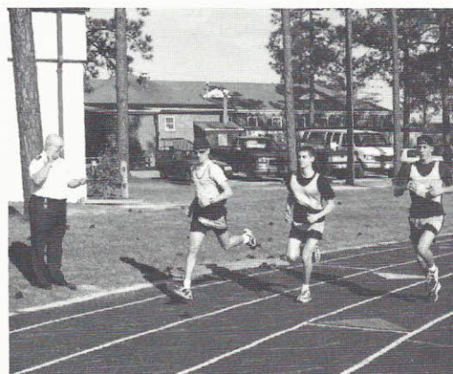
Coach LePage times the cross-country Spartans as they get in shape for long runs over rough terrain.