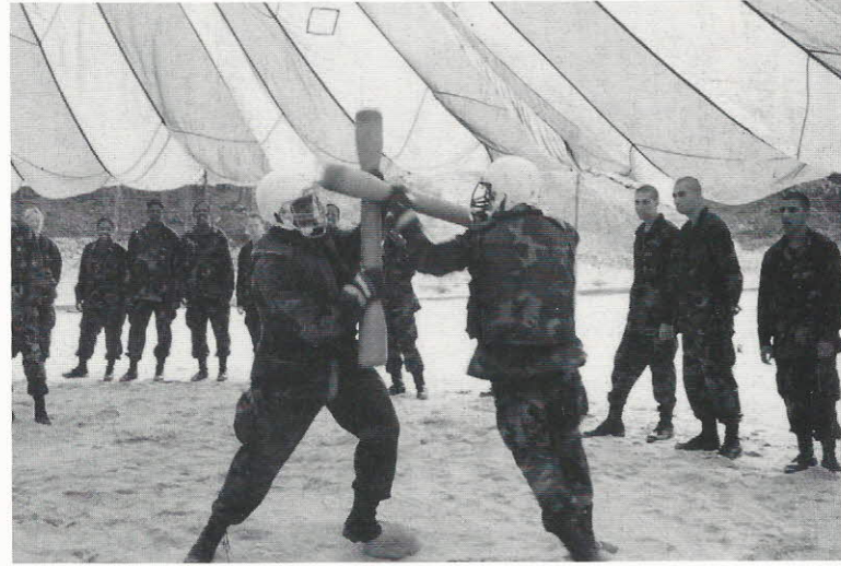
Cadets observe simulated hand to hand combat. The tips of the mock weapons the participants are using represent bayonets.