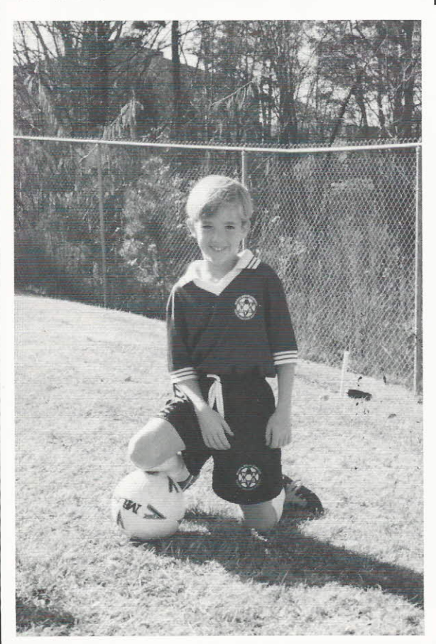
1992 Champions 13-0-0