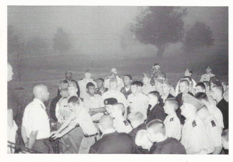
See You at the Flagpole Service: Getting the school year off to a proper start spiritually, a sunrise prayer service was held at the flagpole early in the first semester. The event was well attended by cadets, faculty, and staff.